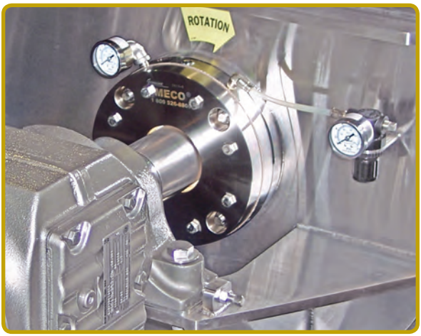
MECO AH AIR PURGED SEAL

Designed for quick and easy cleaning and sanitizing, MECO seals help maintain product purity. Seals and rebuild components are available fully-split, for bench sanitizing or rapid repair on-site.