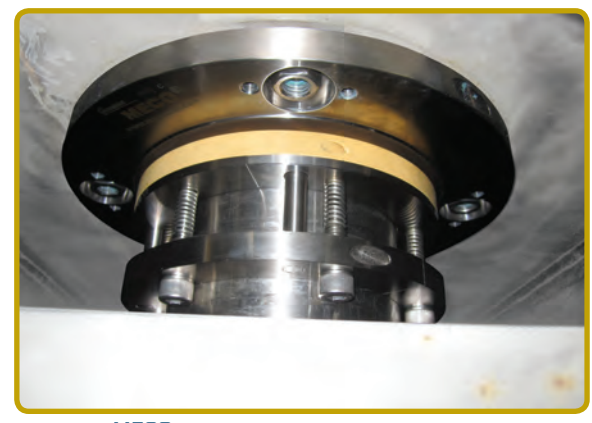
MECO SINGLE FACE SEAL ON A RIBBON BLENDER

SPLIT SEALS CAN USUALLY BE RETROFITTED WITH NO MODIFICATIONS REQUIRED TO YOUR MACHINERY.