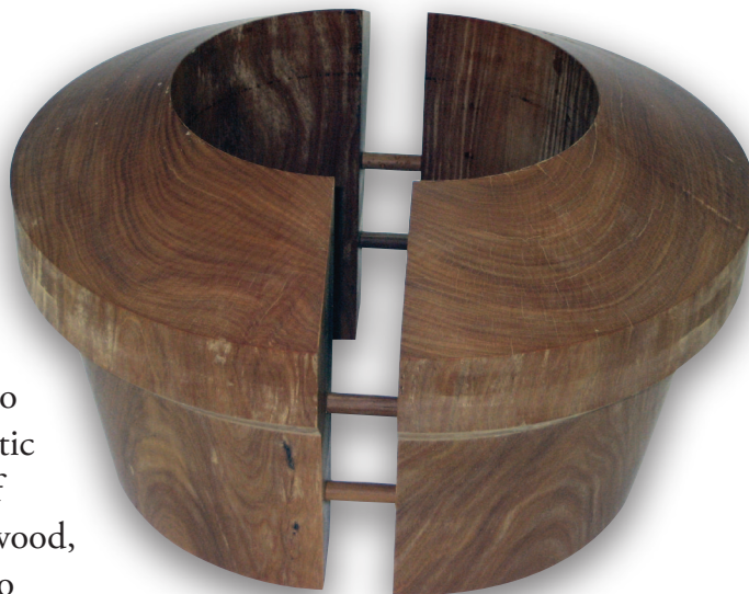
Lignum Vitae thrust bearing.

In most wet applications, there is no substitute for longtime industry-standard lignum vitae wood. Promising service life of up to 60 years or more, "lig" has no serious competition, even from the most modern synthetic materials. Woodex is thoroughly familiar with the art of working this material, and furnishes only select quality wood, precisely machined and carefully sealed in paraffin wax to minimize dimensional changes due to atmospheric conditions.